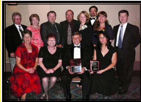
South Dakota Delegates